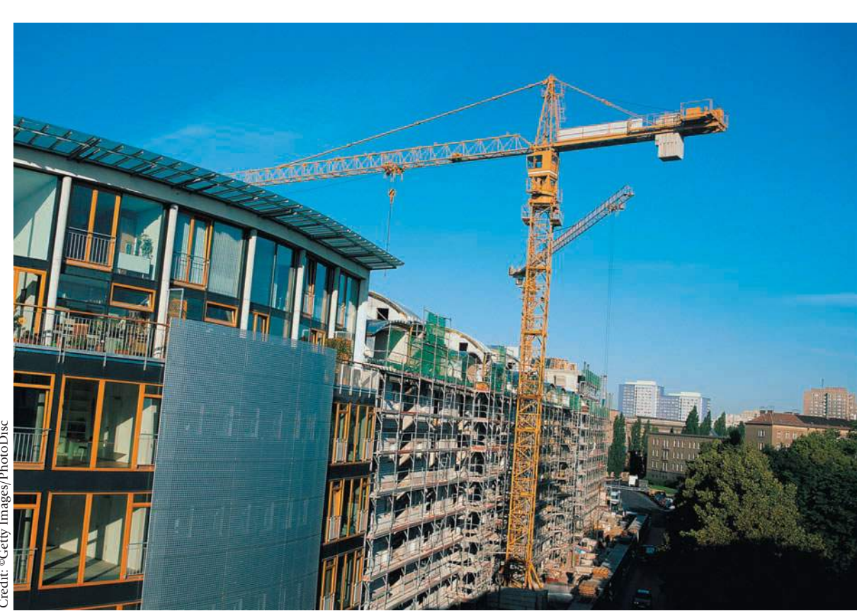
Ait. @Cotta Imagan/DhotoDia